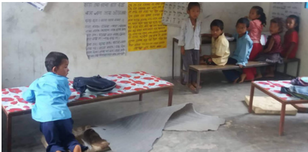
Basic classroom without proper furniture and flooring