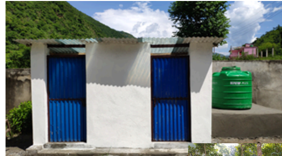
New toilets with water tank and proper sewage system