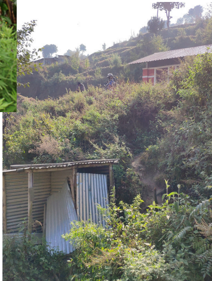
Dilapidated toilets at rural schools without proper waste management